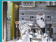
Tool Shop & Special Machinery