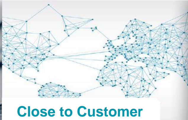
Close to Customer